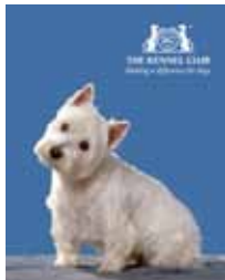
The Kennel Club and Crufts