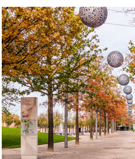
From ExCeL London take the DLR direct to Stratford. 15 minutes from ExCeL London